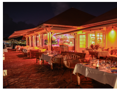
Le Petit Plage On Gustavia Harbor Phone: +590 590 77 73 59

FABULOUS food prepared to perfection, great service & Either outside or indoor (A/C) seating. Anchored smalls boat are just a few feet away making this a romantic setting with the lights of the harbor. Dinner only, absolutely a must.