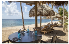
Le Toiny Restaurant Toiny Phone: 0590 2977 47

French, Caribbean, International Rated one of the best on the island. Beautiful & Romantic setting! Amazing cuisine.