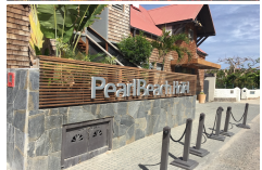
Pearl Beach St. Jean Phone: 0590 52 81 83

We had a "Blast" and food was fab. Count on an excellent meal where you'll enjoy great music mixes. In Pointe Milou, a very chic hideout to discover. Dancing on the tables... It's Wild