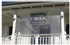
La Isola Gustavia 0590 51 00 05

At Eden Rock Hotel. Rated one of the best on St Barts. Exciting menu to please all. Amazing view restaurant is extended out over the water..