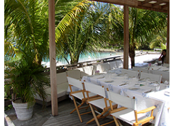
Case de l'isle Anse des Flamands Phone: +590 590 27 61 81

Route du Roi Oscar II Gustavia. Up the white stairs. Wonderful northern Italian cuisine. Reservations are suggested. Moderate to expensive.