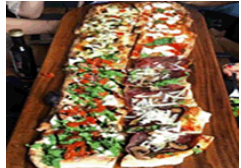
L'isoletta Gustavia Phone: 0590 52 02 02

Romantic setting, excellent service, exquisite menu prepared to perfection. Of course its expensive, but totally worth it. Located at La Toiny Hotel and a beach restaurant too!