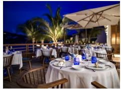
Aux Amis Grand Cul de Sac Phone: 0590 77-4848

FABULOUS food prepared to perfection, great service & Either outside or indoor (A/C) seating. Anchored smalls boat are just a few feet away making this a romantic setting with the lights of the harbor. Dinner only, absolutely a must.