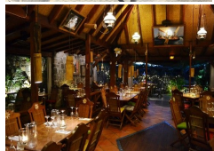
Eddys Gustavia Phone: 0590 27 54 17

Fun place on the beach in St. Jean - Ambitious menu - reasonable prices - exotic beverages.