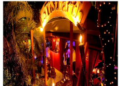
Le Ti St-Barth Pointe Milou Phone: 0590 27 97 71

At Le Barth?lemy hotel, two dining experiences have been created in one spectacular seaside setting. Lunch and Diner.