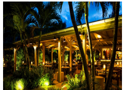
La Tamarin Saline Phone: 0590 29 27 74

A luxurious beachfront setting, la Case de l'isle may become your favorite spot for lunch or dinner as you enjoy light, innovative dishes served poolside. Located at Chevel Blanc St. Barts Isle de France.