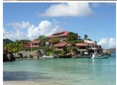
Sand Bar St Jean Beach 0590 29 79 99