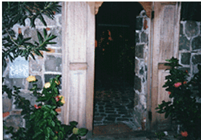
Eddys Gustavia Phone: 0590 27 54 17

Fun place on the beach in St. Jean - Ambitious menu - reasonable prices - exotic beverages.