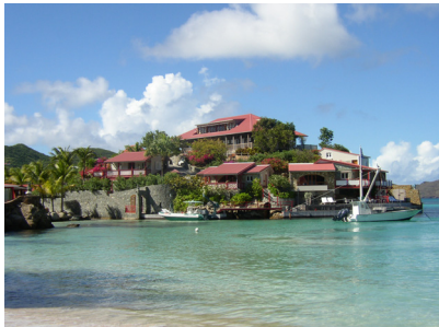
On the Rocks St Jean Beach 0590 29 79 99