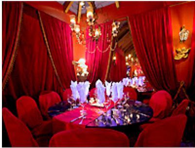
Le Ti St-Barth Pointe Milou Phone: 0590 27 97 71

www.Go2StBarts.com (212) 228-7100 (888) 839-0550