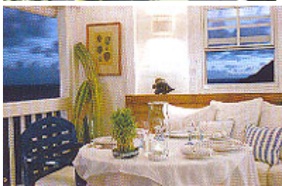
Le Toiny Restaurant Toiny Phone: 0590 29 77 47

Thin crust pizza is amazing & quite a value at 12 euros. Be patient, the service is slow, but the food is great. Locals love it. Reservations a must.