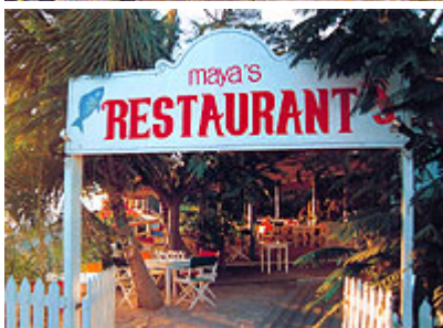
Maya's Public Beach Phone: 0590 27 75 73

Romantic setting, excellent service, exquisite menu prepared to perfection. Of course it's expensive, but totally worth it. Located at Le Toiny Hotel.