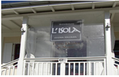
L'Isola Gustavia 0590 51 00 05

www.Go2StBarts.com (212) 228-7100 (888) 839-0550