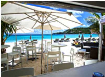
La Plage Beach Restaurant St. Jean Phone: 0590 52 81 83

We had a "Blast" and food was fab. Count on an excellent meal where you'll enjoy great music mixes. In Pointe Milou, a very chic hideout to discover. . Dancing on the tables... It's "Wild"