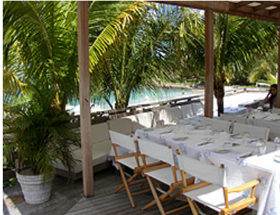
Case de l'isle Anse des Flamands Phone: 0590 27 61 81

Route du Roi Oscar II Gustavia. Up the white stairs. Wonderful northern Italian cuisine. Reservations are suggested. Moderate to expensive.