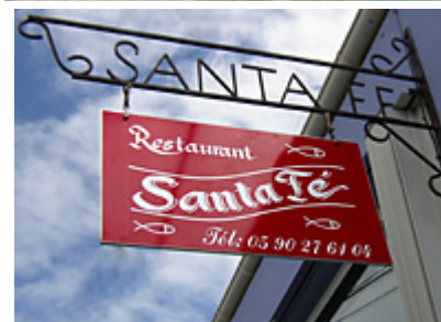
Santa Fe Lurin Phone: 0590 27 61 04 Lunch or Dinner

At Eden Rock Hotel. Rated one of the best on St Barts. Exciting menu to please all. Amazing view restaurant is extended out over the water.