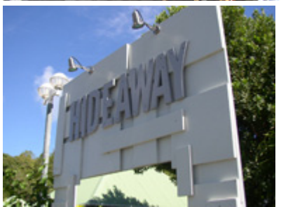
Hideaway St. Jean Phone: 0590 27 63 63

A luxurious beachfront setting, la Case de l'isle may become your favorite spot for lunch or dinner as you enjoy light, innovative dishes served poolside. Located at Chevel Blanc St. Barts Isle de France